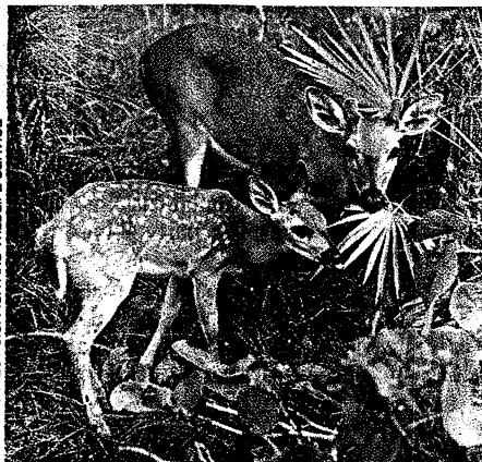
JOHN OBERHEU / U.S. FISH AND WILDLIFE SERVICE